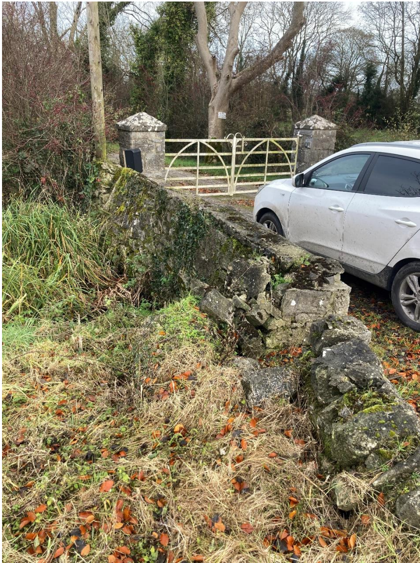
Plate 47: Entrance gate and piers to south of Court country house (RPS Ref. 291) to west of proposed temporary transition compound.