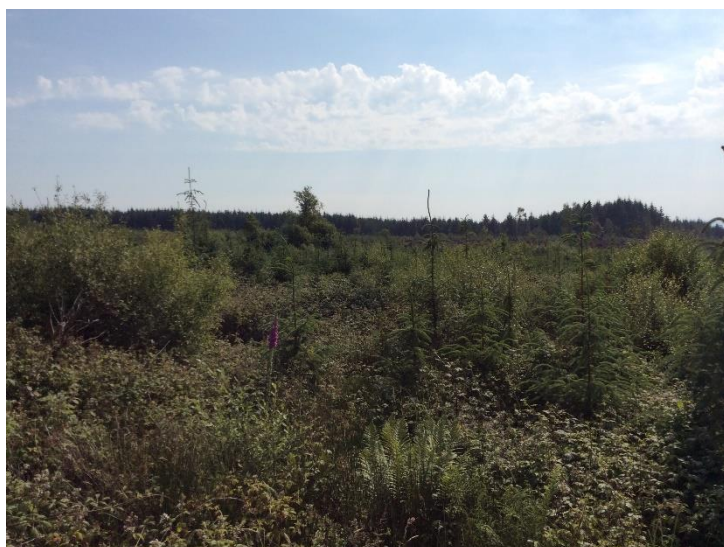
Plate 23: Proposed borrow pit to west of T7, looking NE.