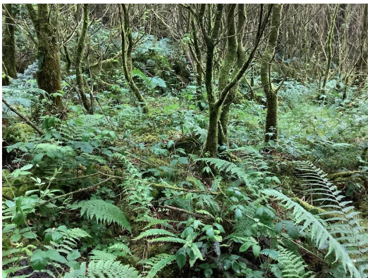
Plate 2: Area of T1 in forestry.