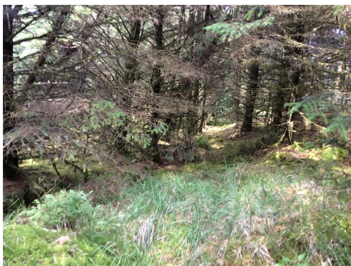
Plate 9: As above further to SE, looking NW.