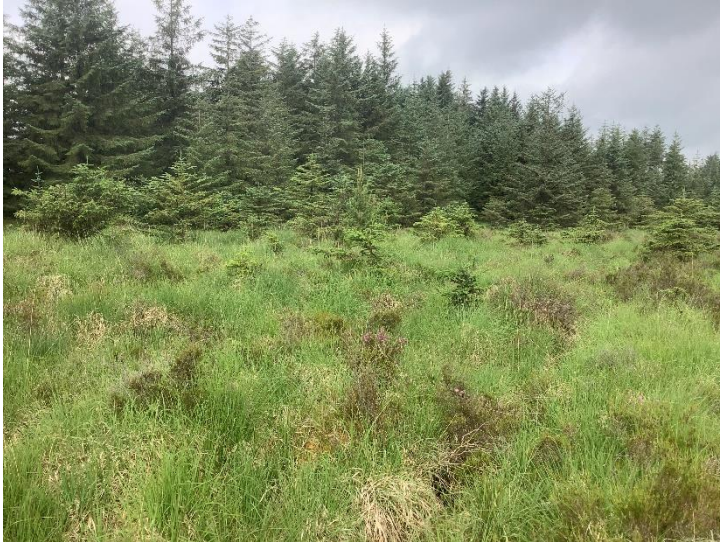
Plate 28: Proposed construction compound to NW of T9, looking W.