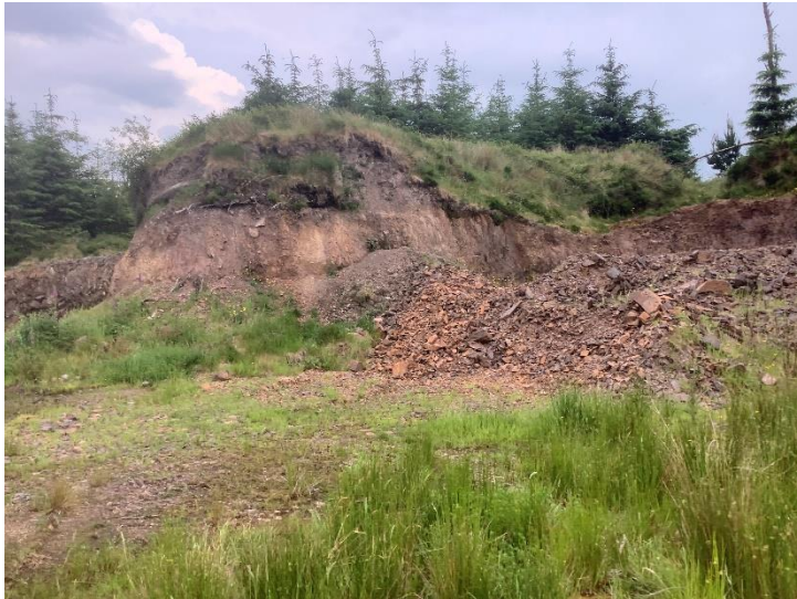
Plate 4: Proposed borrow pit east of T1.