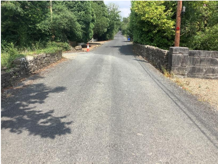
Plate 40: Bridge CH3 on proposed underground electrical cabling route, looking N.