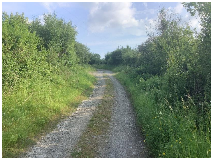
Plate 42: Proposed underground electrical cabling route in Trough townland, looking S.