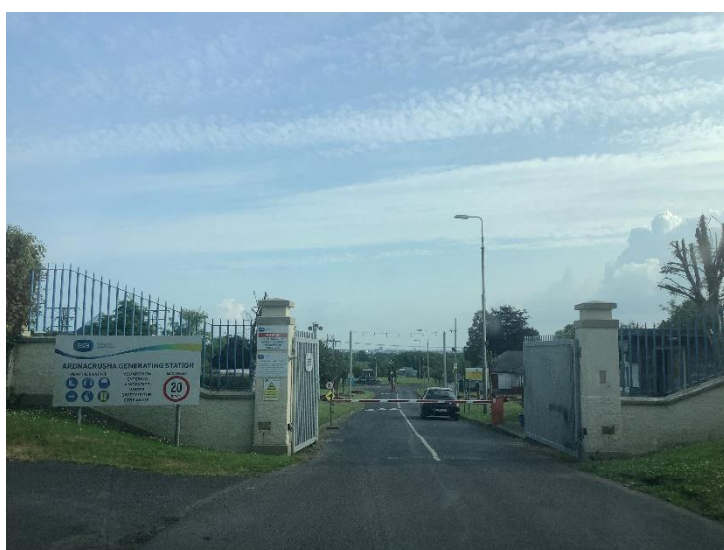
Plate 44: Entrance to Ardnacrusha Generating Station into which the proposed underground electrical cabling route will connect.