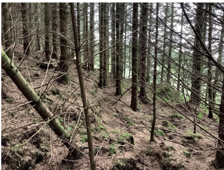
Plate 6: General location of T2 in forestry, looking W.