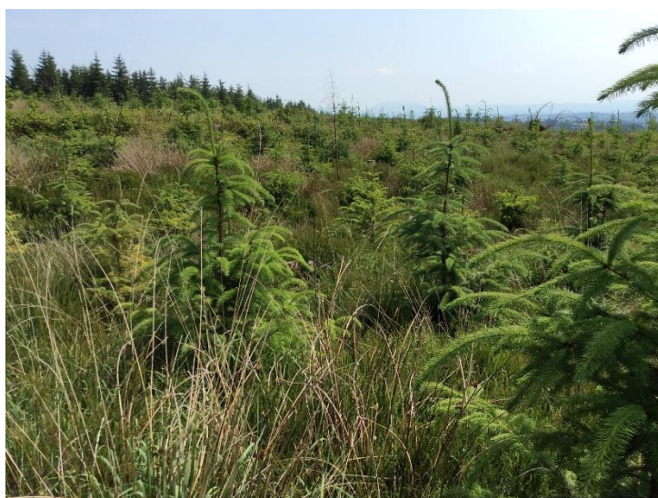
Plate 12: General view of proposed hardstand for T4.