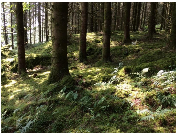
Plate 18: Hardstand for T6 in forestry.