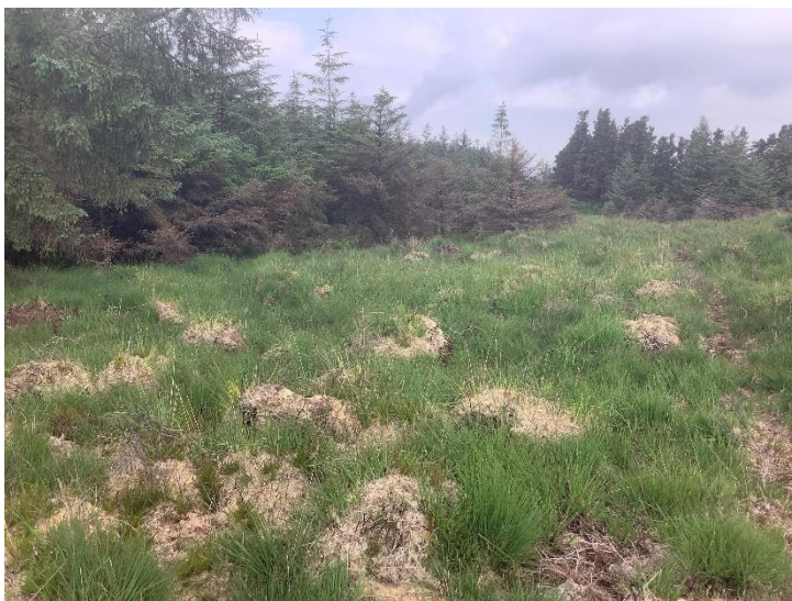
Plate 27: Hardstand for T8, looking NW.