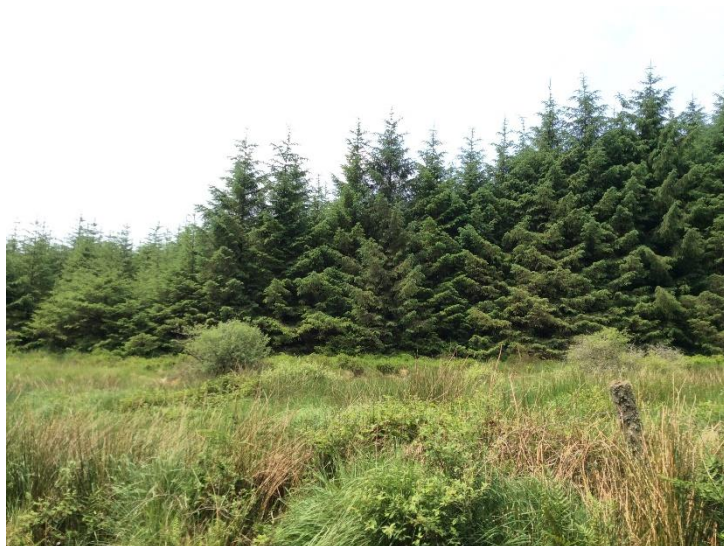
Plate 8: Route of proposed road between T2 and T4, looking NW.