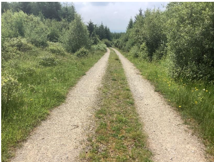
Plate 32: Existing forestry track due for upgrade to SE of T9, looking S.