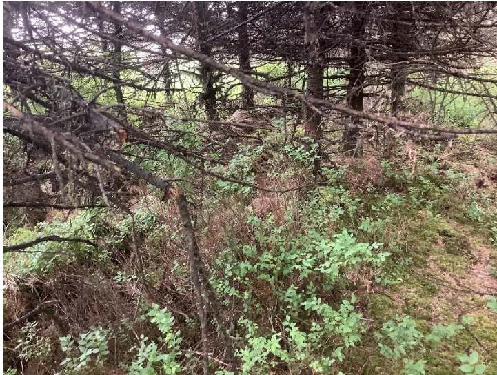
Plate 26: Location of T8 in forestry.