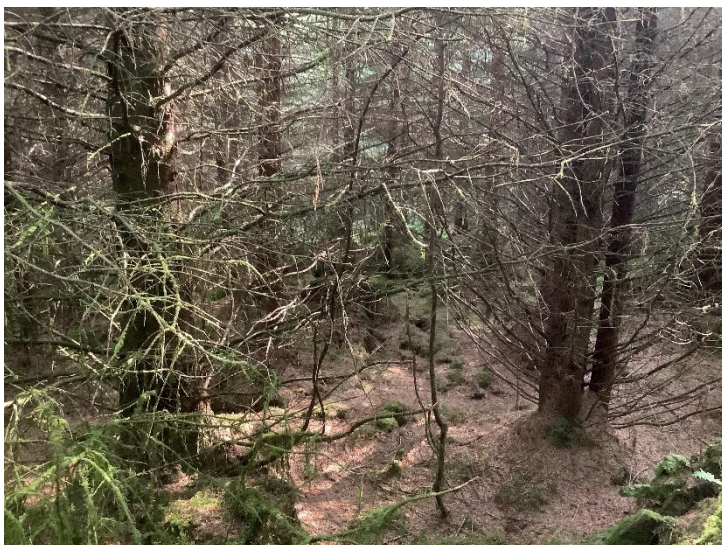
Plate 31: Proposed borrow pit to E of T9, looking NE.