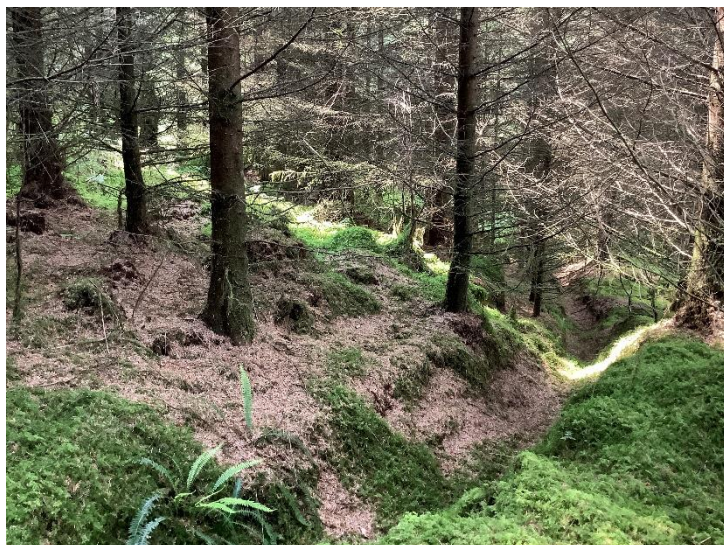
Plate 7: Proposed construction compound in forestry SE of T2, looking NW.