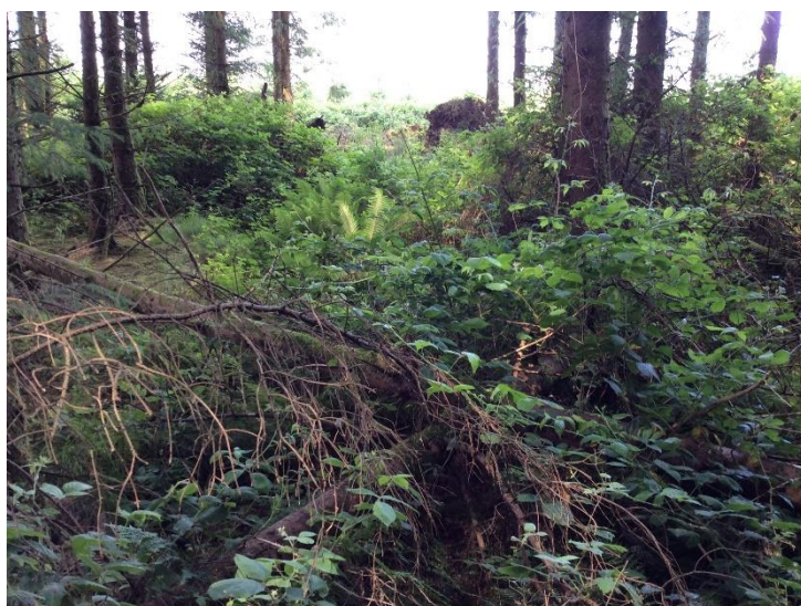
Plate 21: Hardstand for T7, looking NW.