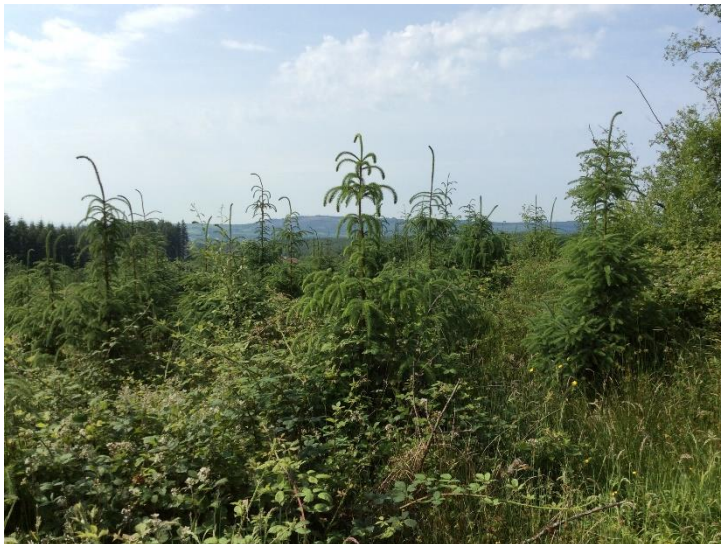
Plate 14: Route of proposed road to T7 through dense forestry, looking SW.