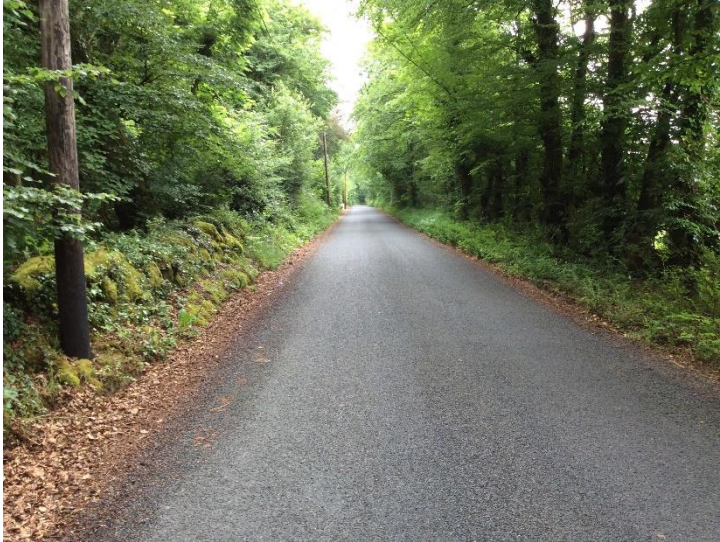
Plate 39: Proposed underground electrical cabling route further to SE, looking SE.