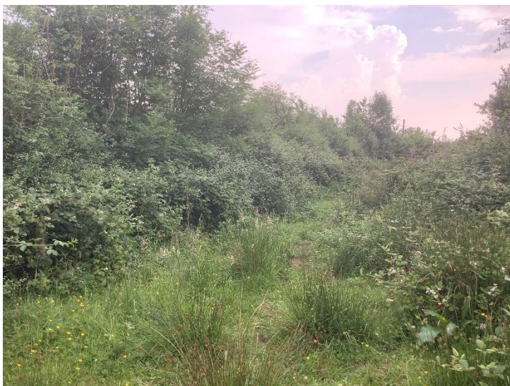
Plate 46: As above, looking SW.