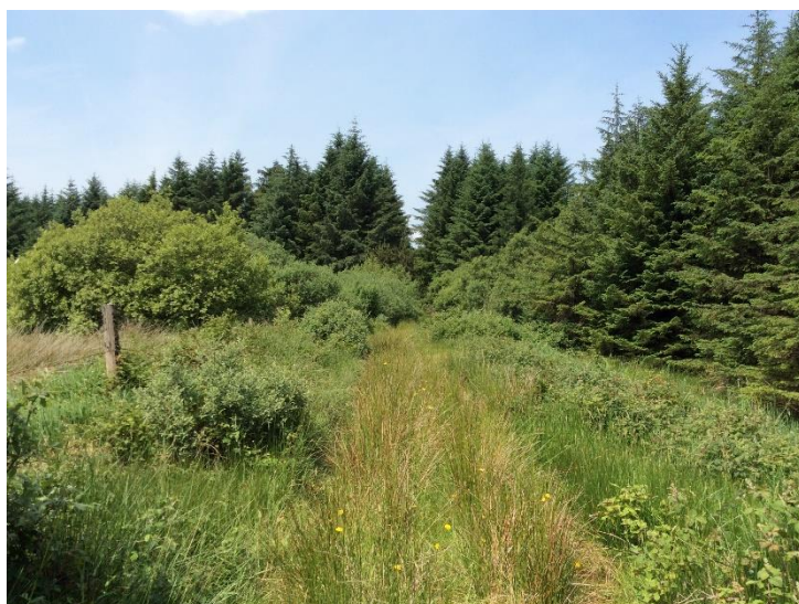
Plate 11: Existing track due for upgrade to NW of T4, looking NW.