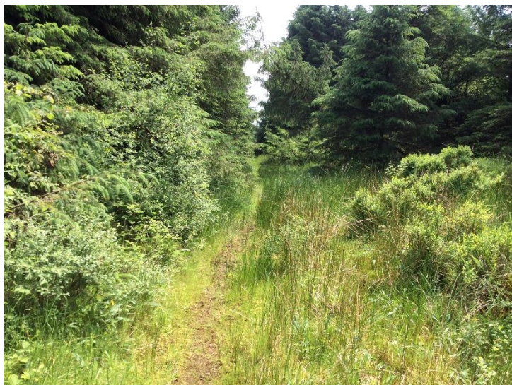
Plate 10: Existing track due for upgrade to NW of T4, looking SE.