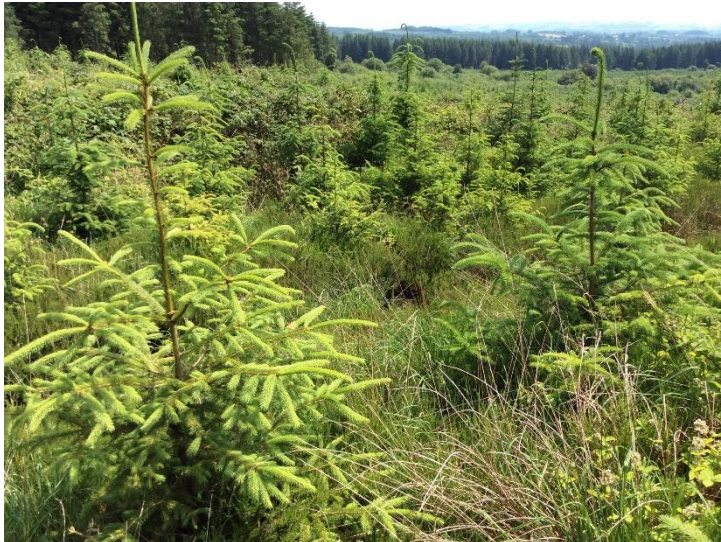
Plate 13: General view of T4 in young forestry.