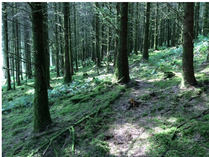
Plate 19: General view of T6, looking SSW.