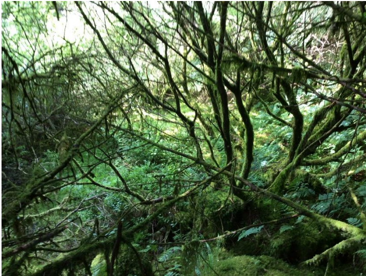
Plate 17: Dense forestry/undergrowth in area of proposed construction compound south of T5, looking SW.