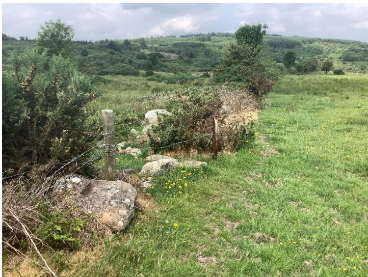
Plate 35: Route of proposed road in Kilmore townland further to south, looking NW.