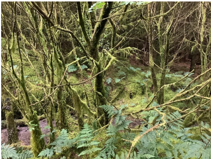
Plate 1: Proposed hardstand for T1 in forestry, looking SW.