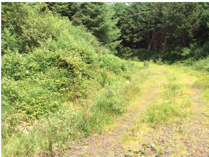
Plate 37: Proposed underground electrical cabling route along existing forestry track to SW of proposed substation location, looking NE.