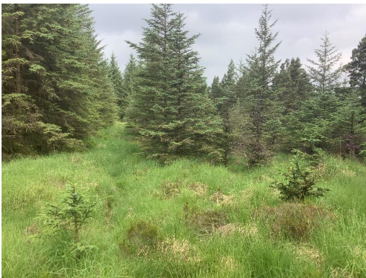
Plate 30: Hardstand for T9, looking NW.