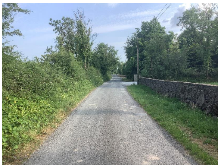
Plate 43: Proposed underground electrical cabling route further to south in Roo West townland, looking S.