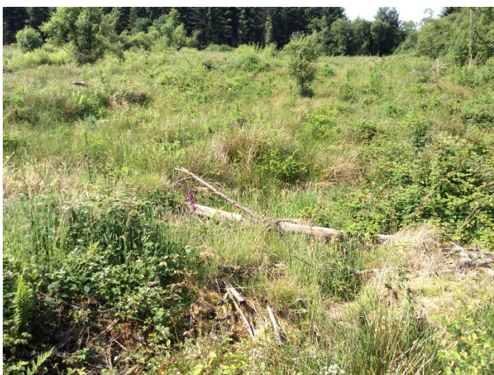
Plate 15: General view of T5, looking SW.