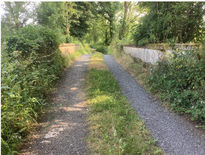
Plate 41: CH4, Trough Bridge.