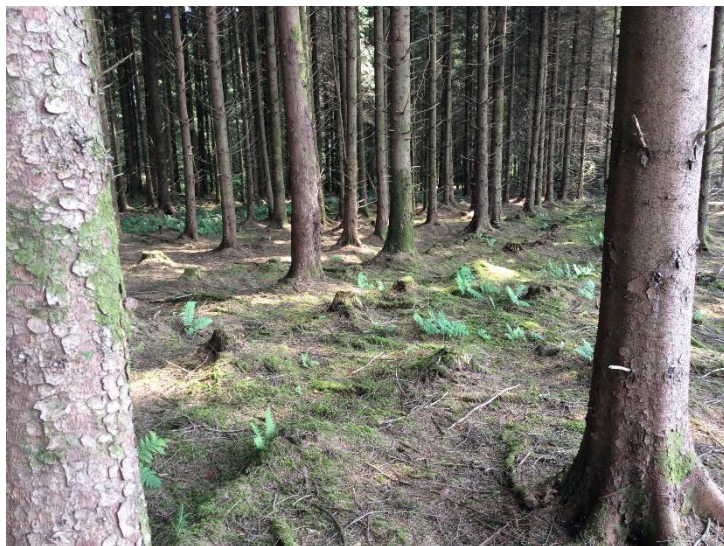
Plate 20: Location of T7 in forestry, looking NE.