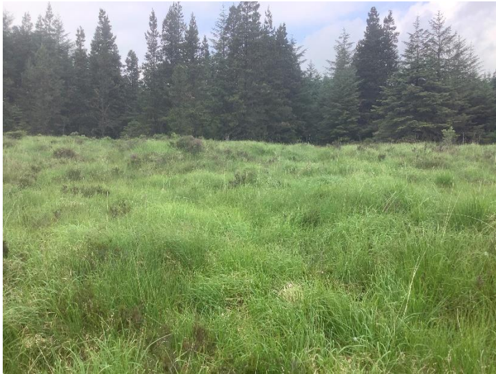
Plate 25: Route of proposed road to T8, looking SW.