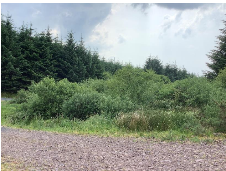
Plate 3: Route of proposed road to T1, looking SW.