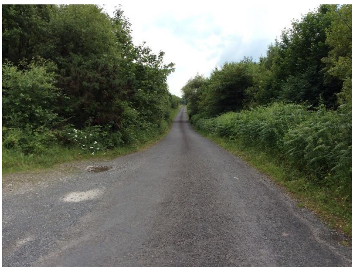
Plate 38: Route of proposed underground electrical cabling route on public road in Drumsillagh or Sallybank (Parker) townland, looking SSE.