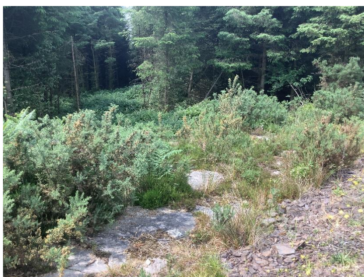
Plate 24: Route of proposed road west of T8 and NE of T6, looking WNW.