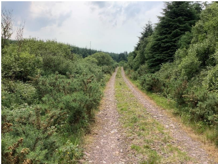
Plate 5: Existing track due for upgrade to NE of T1, looking SW.