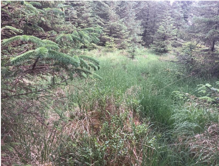
Plate 29: T9 in forestry, looking NW.