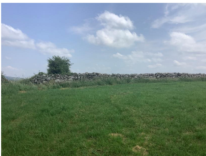
Plate 36: Route of proposed road through pasture in Kilmore townland, looking E.