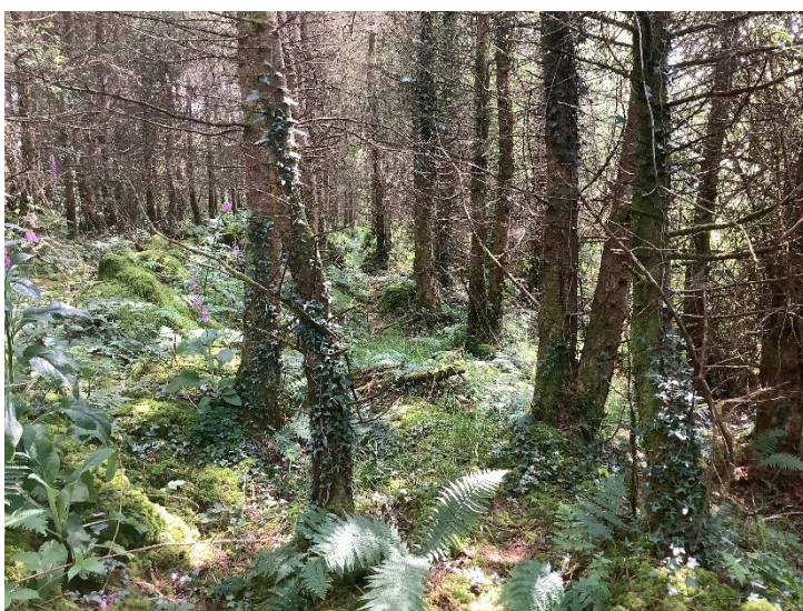
Plate 33: Proposed overrun area /proposed road at SE side of Proposed Wind Farm Site, looking SE.