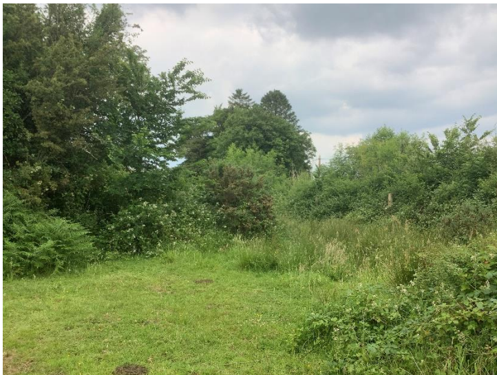
Plate 45: Roadside boundary in proposed works area to SE of enclosure CL053-007—, looking NE.