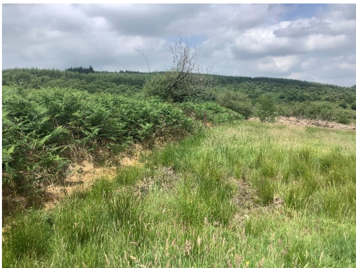
Plate 34: Proposed road /overrun area in Kilmore townland, looking NW.