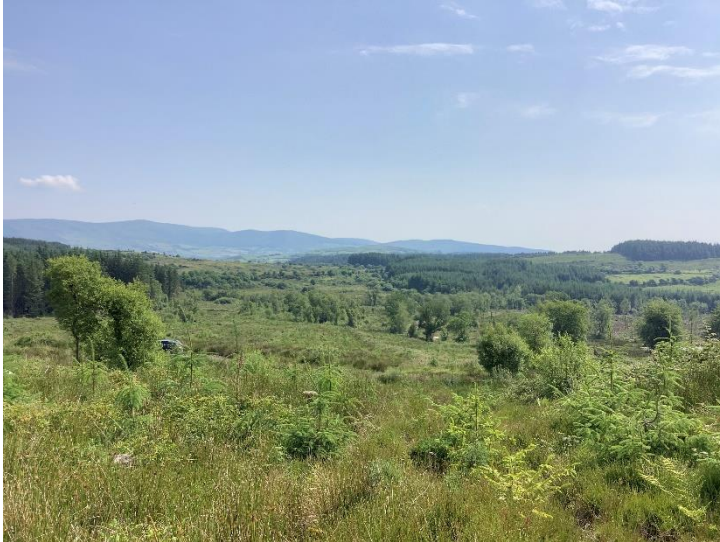
Plate 16: General view of hardstand for T5, looking NE.