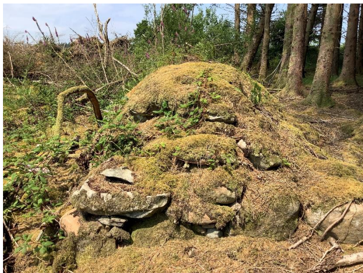
Plate 22: Stone and earth field boundary at west side of hardstand for T7, looking NW.